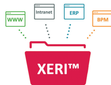
Flexible integration capabilities

One of the most important tasks of an organization is to obtain, expand, transfer, and protect knowledge. This task is also a central component of ISO 9001:2015. XERI™ is an ideal tool for performing this task. All topics relating to knowledge management in an organization such as documented information, communication, integration of external partners, standardization of management systems, and the documentation of processes are organized easily on the web using XERI™ and then made available to the corresponding employees.